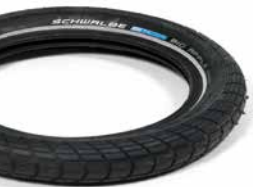
Schwalbe Big Apple Tyre with Puncture Protection